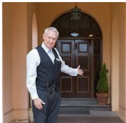
Welcome to Cummins House

There has been a good response from members (and their friends) booking for the visit to Cummins House. Twenty three have booked for the guided tour and Devonshire morning tea which will be followed by lunch at the nearby Highway Hotel on the Anzac Highway. Bookings are now closed. At this stage, all participants have organised their transport to Cummins House so there is no need to meet at Hazelwood Park before proceeding to Cummins House, which is located at 23 Sheoak Ave, Novar Gardens. Please arrive by 10.15am so that we can have a punctual start to the visit at 10.30am. It could take up to 40 minutes by car from Burnside to the House.