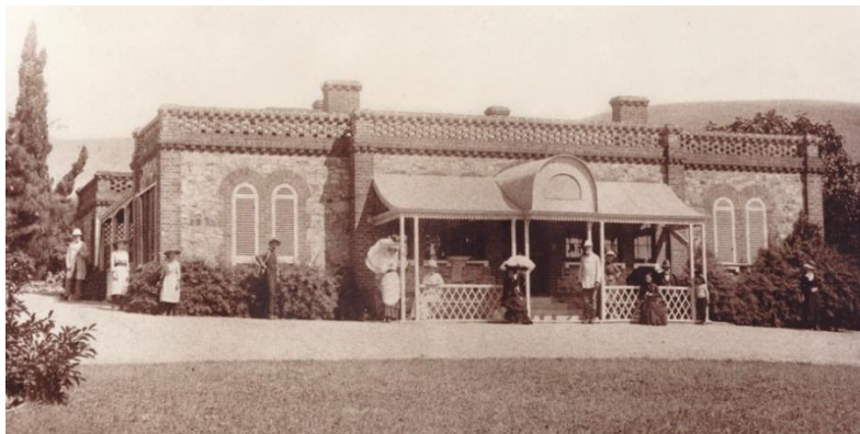
Beaumont House c. 1880