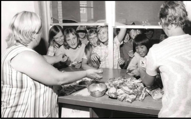
Ye olde school tuck shop