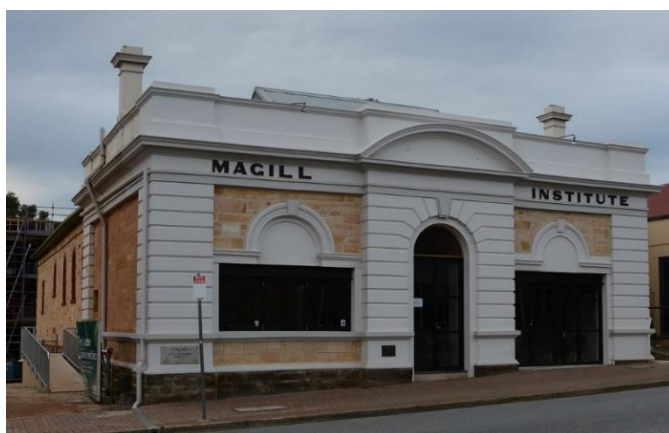
The Magill Institute established 1858