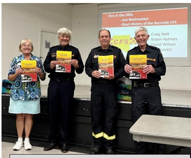
Burnside CFS members with their copies of the Journal