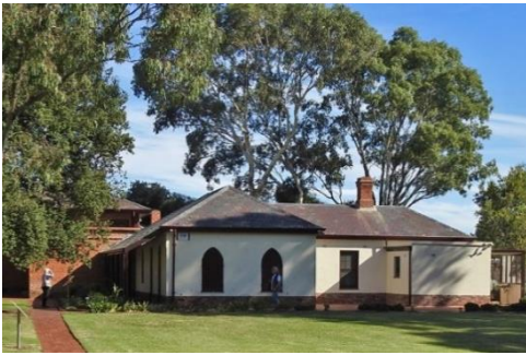
Sturt's Cottage "The Grange" Museum visit

A visit to Grange and Henley, Thursday October 19