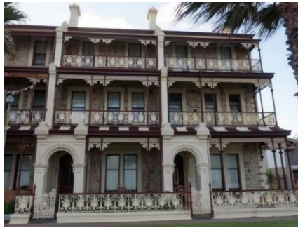
The Marine Terraces (1882) Historic Grange foreshore tour