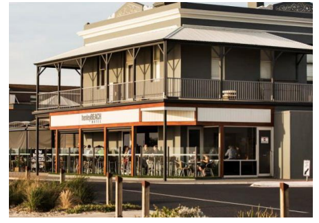
Henley Beach Hotel for lunch