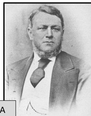
Henry Ayers (1821-1897)